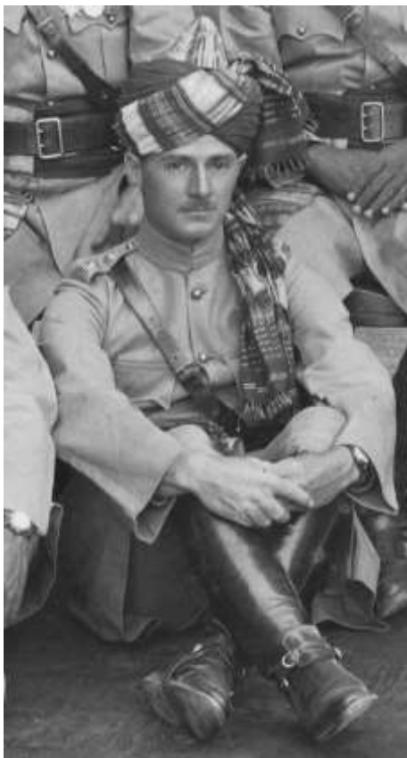
LIEUTENANT JACK ALFORD, 1932

The only British tanks to be employed in the defence of Singapore Island belonged to the 100th Independent Light Tank Squadron (100th I.L.T. Sqn), Indian Armoured Corps, commanded at the onset by Major Jack 'Boy' Alford of the Indian Army.. This article discusses the 100th I.L.T. Sqn, its movement to Singapore, and subsequent employment on the Island covering the period from the 29th January to 15th February 1942.